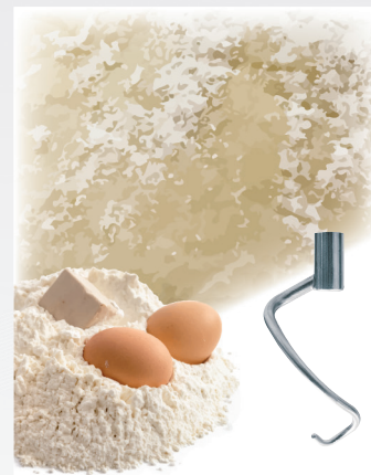
Kneader, stainless steel 15 00 205*

*plastic splash guard and feeding chute (not pictured) *included