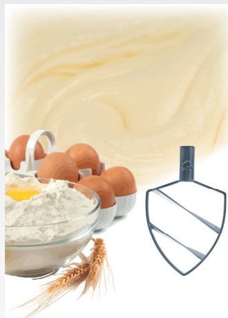
Stirrer, stainless steel 15 00 227*