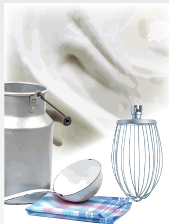
Beating whisk, stainless steel with Ø 2,5 mm wires 15 00 228*