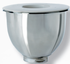
5 l stirring bowl, stainless steel 15 00 206* Cover for stirring bowl white 15 00 225*